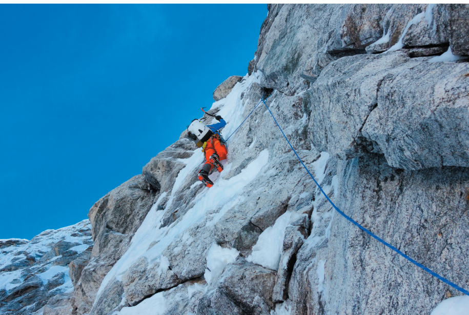
Matija Volontar climbing the initial ground on the first ascent of the west face of Pomlaca. See p242. (Bor Levičnik)