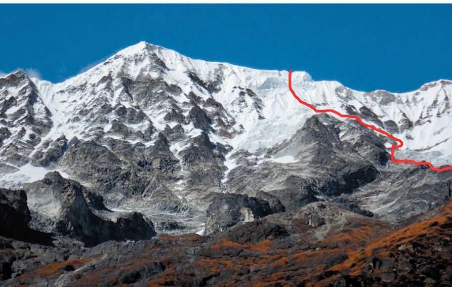
The Japanese line on Chekigo Peak. ( Hiryoshi Manome )

from the village all their Sherpa team call home. The route is 1,400m with difficulties up to 5.6 to 5.8 with significant mixed terrain.