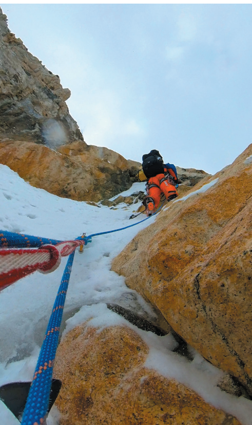
Starting up the rock band at two-thirds height on Sura Peak during the first ascent of Simply Beautiful . (Marek Holeček)