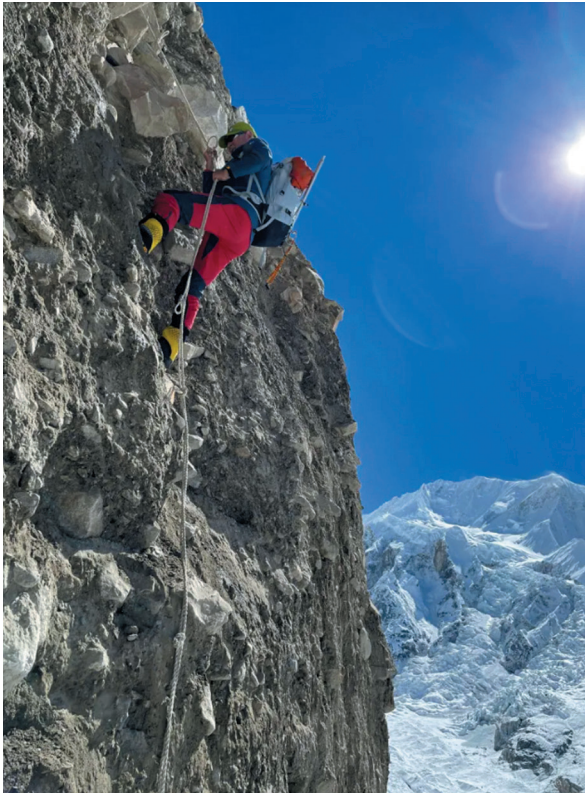
Himlung remains a popular 7,000m challenge but changing glacier conditions are making the approach more difficult. Climbing a fixed line up a steep moraine bank.

Towards the end of every season, guides, agents and expedition owners start to return from their offices and the mountains to their favourite cafes in Kathmandu. Conversations always turn to what kind of a season they have had. The usual response is, 'Well, not so good but not so bad. Fingers crossed for next season.' And so everyone had high hopes for the autumn season of 2022. Expeditions to the 8,000m peaks showed a high booking rate but as the monsoon lingered on optimism began to wane.