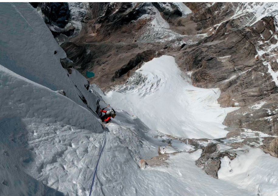
Higher on the west face of Pomlaca. (Matija Volontar)